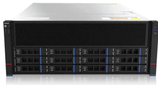
Front View of 4U 12-bay 5-GPU Cards Model