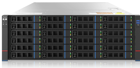
Front View of 4U 24 -bay Model